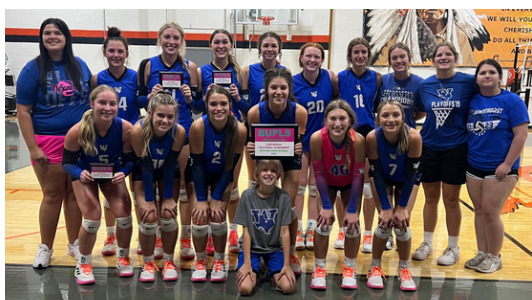
Nocona Buckle Up for Lane Tournament Champions