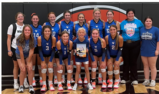
Burkburnett Cool in Boomtown Tournament Champions

"We have been off to a great start already this season and hope to become more consistent as the season progresses. Our JV Blue team is off to a 4-0 start and our JV White team is 2-1 so far. All teams are very competitive and also such a fun group of girls to coach."