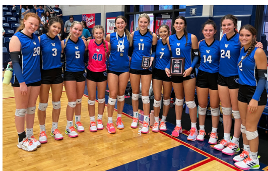
Graham Lu Allen Memorial Tournament Runners-Up