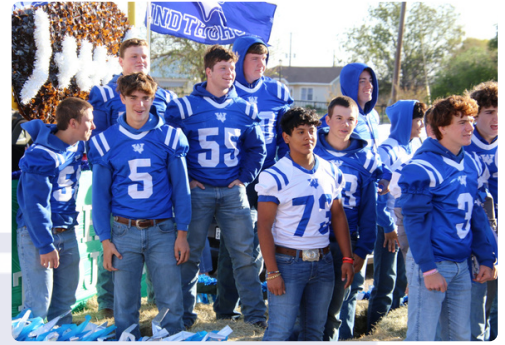
The Trojans shine bright like diamonds being cheered on as they make their way across the parade.